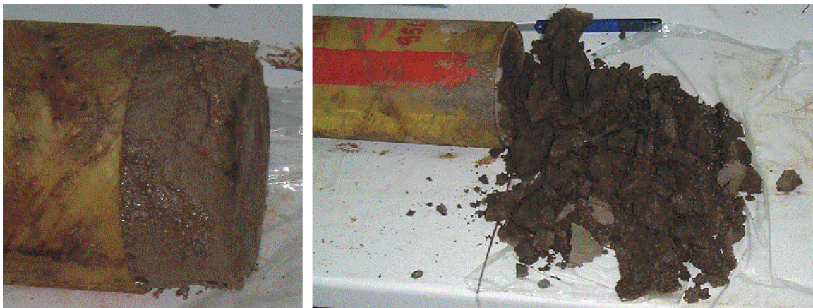
Figure 2 Core Damage During Extracting Weak Rock From Fibreglass Inner Tubes

In traditional core barrels, an average of 8-12% of the recovered cores were often becoming stuck, particularly the high porosity and high permeability zones, and were difficult to extract out of the inner tube. As shown in figure 1, severe damage sometimes took place during core extraction, delivering samples far from representative for the rocks in situ. With the new core barrel concept, the pre-split inner core barrel can be open by just lifting the top half, thus minimising or even eliminating such damage.