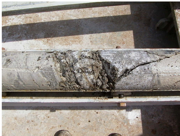
Figure 4 New Pre-Split Inner Tube System Facilitates Studying Natural Fracture Network